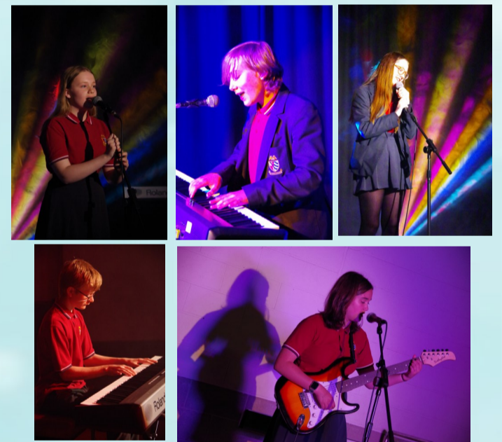
Covid may have prevented a live audience but it certainly didn't stop these performers from shining.

We hope you have a great summer, and we look forward to being able to see you in person at our next concert. Mr Cope